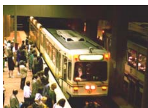
Light rail underground

This alternative would provide light rail service every 5 minutes in the peak and every 7½ minutes off-peak from the North Shore, through downtown Pittsburgh and Oakland to either Wilkinsburg or Homestead. The route would be entirely underground, except for the possible portion between Oakland and Homestead. Stops would be at the North Shore, Pittsburgh and Oakland and either Squirrel Hill and Wilkinsburg or Glen Hazel, Hazelwood, Greenfield and Homestead. Connections with the South Hills light rail lines would be possible in downtown Pittsburgh.