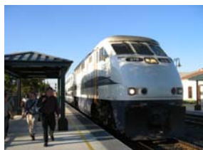
Commuter rail diesel locomotive and coach cars

This alternative would provide hourly commuter rail service in the peak and every 90 minutes in the off-peak on an 18.3-mile route between Arnold and Pittsburgh's Strip District. The service would be entirely along the Allegheny Valley Railroad, which parallels the Allegheny River. Stops would be in Arnold, New Kensington, Oakmont, Verona, Penn Hills and Pittsburgh. A bus shuttle would bring riders from the Strip District to the Golden Triangle.