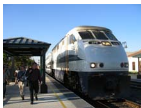
Commuter rail diesel locomotive and coach cars

This alternative would provide hourly commuter rail service in the peak and every 90 minutes in the off-peak on a 30.9-mile route between Greensburg and downtown Pittsburgh via the Norfolk Southern Pittsburgh Line. Stops would be in Greensburg, Jeannette, Irwin, Trafford, East Pittsburgh, Wilkinsburg and Pittsburgh.