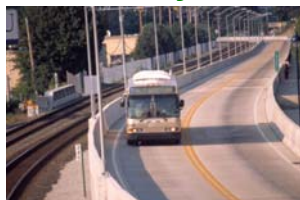
Busway along existing freight railroad right-of-way

This alternative would be a 6.6-mile extension of the existing East Busway, which currently extends from downtown Pittsburgh to Swissvale, paralleling Norfolk Southern's Pittsburgh Line. This extension would allow public transit buses to travel on exclusive, bus-only roads as far east as Monroeville. New stops would be at Braddock, Keystone Commons and the Monroeville Mall. Service frequency for buses on the East Busway would be unchanged.