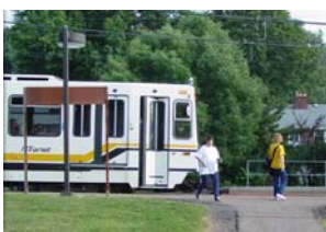
Light rail at-grade

This alternative would provide light rail service every 10 minutes in the peak and every 20 minutes in the off-peak between McKeesport and Pittsburgh (17.5 miles) and Etna and Pittsburgh (5.3 miles) via Allegheny Valley Railroad and CSX rights-of-way. Stops would be in McKeesport, Braddock, Rankin, Glen Hazel, Hazelwood, Greenfield, Oakland, Etna, Millvale and downtown Pittsburgh. Connections with the South Hills light rail lines would be possible at the Steel Plaza T station.