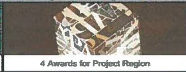
4 Awards for Project Region