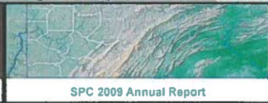
SPC 2009 Annual Report