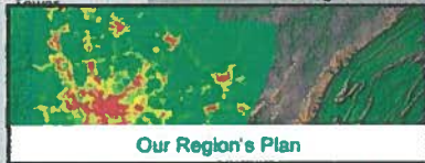
Our Region's Plan