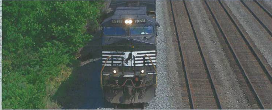
Freight train in Beaver County. Click the image to read more about freight in our region.