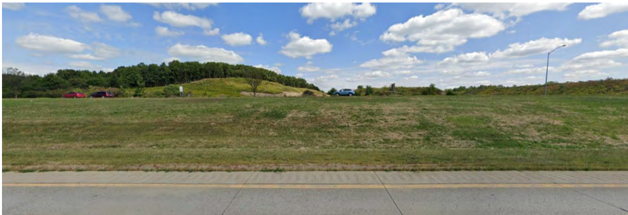
Figure 2 - View of MM-78.6 from Southbound Lanes

The sedan sustained extensive damage and debris was scattered on both sides of the Interstate. First responders originally closed the left lanes on both sides of the Interstate. Southbound lanes were closed at Exit 85 Evans City in Jackson Township around 1630, and shortly after the Northbound traffic was halted at exit 78 to Route 228. Figure 3 on the next page shows the traffic blockage.