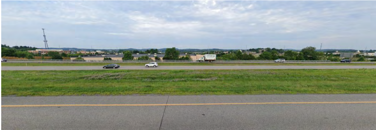
Figure 1 – View of MM-78.6 from Northbound Lanes

The sedan came to a stop in the median facing north, closer to the southbound lanes. The median slants down from the north lanes to the south as seen in the pictures below.