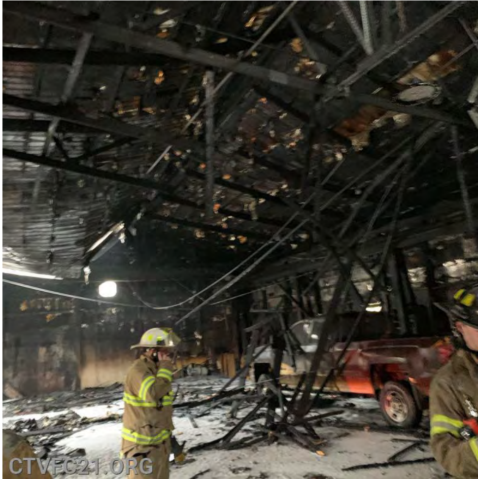
Figure 4 - Commercial Structure Fire

The crews encountered heavy smoke and fire from a large commercial garage, which upon further investigation contained unknown chemicals and vehicles. The Fire was reported under control at 1210, and the units cleared at approximately 1400.