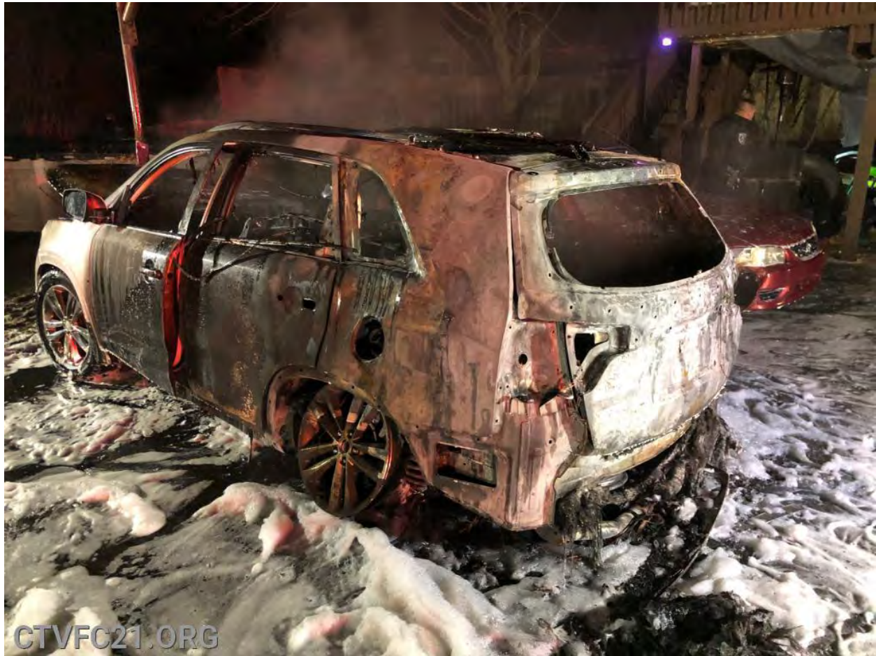
Figure 5 - Vehicle Fire

Station 90 was dispatched a second time on January 28 th at 2358, this time for a structure fire in Cranberry Township. A vehicle was seen on fire in a driveway, endangering a nearby house. Soon after arriving to the scene, firefighters extinguished the car with no impact to the structure.