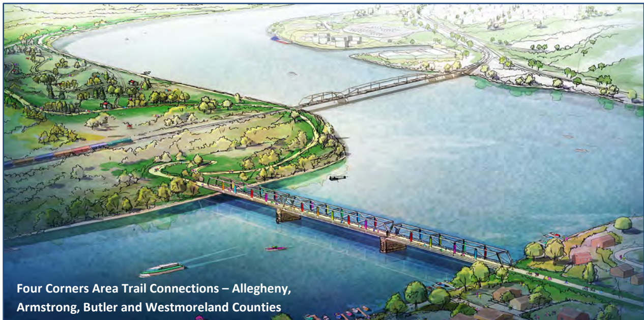
Four Corners Area Trail Connections – Allegheny, Armstrong, Butler and Westmoreland Counties

The provision of bicycle and pedestrian facilities and improvements plays an important role in the economic vitality of communities, both large and small, across the region. Improving bicycle and pedestrian facilities in the region's communities can support local business and bolster tourism via intraregional connections such as the Three Rivers Heritage Trail and the Great Allegheny Passage. The 2023-2026 TIP will dedicate $18.2 million in Transportation Alternatives Set-Aside Program (TA Program) funding to expand the bicycle and pedestrian network facilities such as sidewalks, bike lanes and shared use paths to connect or further expand existing facilities. Additionally, the SPC SMART Program will allocate an additional $12 million in funds to increase the sustainability and livability of communities in the region. These are competitive funding programs and projects will be added to the TIP as they are selected.